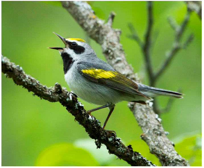
One of the only Golden Winged Warbler populations in NC is found along the ANST in the Project corridor \,

Tribal coordination has been ongoing since the Project's restart in 2015 and will be maintained for the duration of the project. The Project is undertaking coordination with all impacted local Tribes, including the Cherokee Nation, the Eastern Band of Cherokee Indians, the United Keetoowah Band of Cherokee Indians, the Catawba Nation, and the Muscogee (Creek) Nation.