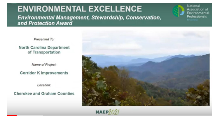
Figure 1. Click <u>here</u> to see a video about project and the Environmental Excellence Award.

Environmental approvals, final design, and right of way (ROW) for A-0009C have been completed. and sections CA, CB, and CC were all let in 2022. Construction on these sections is anticipated to be complete in late 2027 or early 2028. Utility relocation has been completed for section CA and is ongoing, with anticipated completion in 2024 for the remaining sections. Rural funding is needed to complete the final section of A-0009C; if awarded, funds will be obligated immediately upon completion of the grant agreement and construction will commence in the summer of 2024. The design and construction of GRAHAM's ITS components are expected to last up to 12 months and would begin concurrent with construction for A-0009CD. Figure 1 illustrates the schedule for completion of this part of Corridor K.